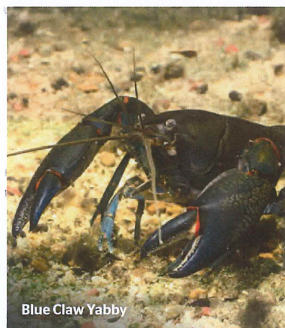
Blue Claw Yabby

Carp (Cyprinus Carpio) is also found in our waterways. Carp must not be returned to the water alive or dead.