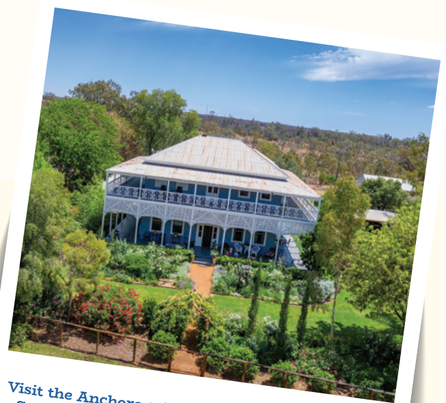
Visit the Anchorage Homestead on guided tour in St George. Built in 1903 and steeped in history.