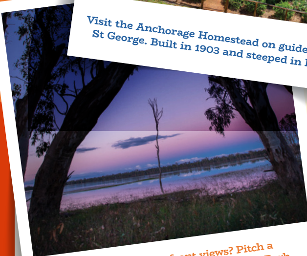
Looking for waterfront views? Pitch a tent at Lake Broadwater Conservation Park and admire this delightful waterhole.