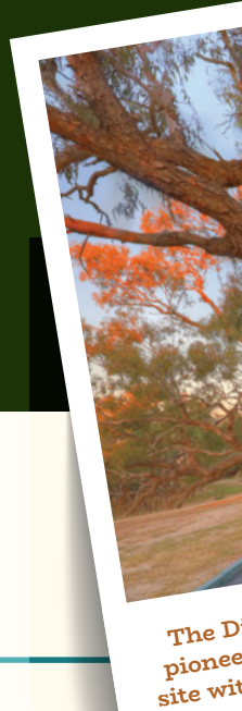
The D pione site wit