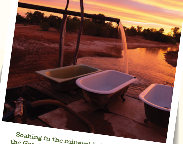
Soaking in the mineral-laden water from the Great Artesian Basin is a local favourite way to end a day in Cunnamulla.