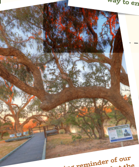
The Big Tree is an enduring reminder of our pioneering spirit. Camping is permitted at the site. Basic bush camping facilities provided.